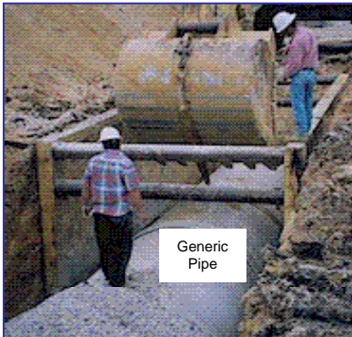
Collection system pipe sizes range from less than one foot to more than six feet in diameter.

This project includes the replacement of five pump stations and the upgrade of three pump stations. These will work in conjunction with the force main and gravity sewer upgrades in the North Gravity Basin to alleviate chronic SSOs in the basins upstream of the pump stations.