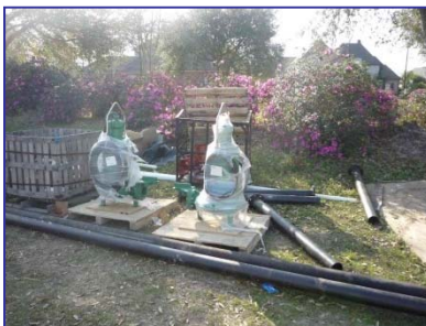
New submersible pumps wrapped from the factory and ready for installation into wet wells.