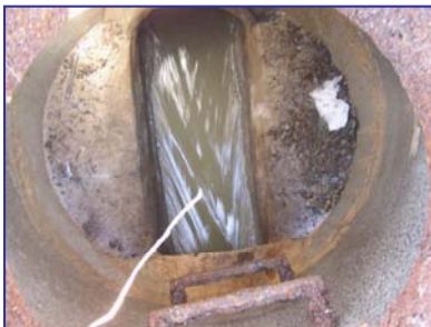
Flow measurements are taken throughout the collection system to determine the correct pipeline size.